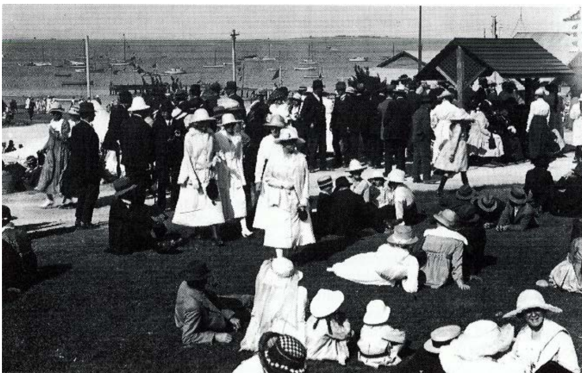
Opening Day: circa 1921.