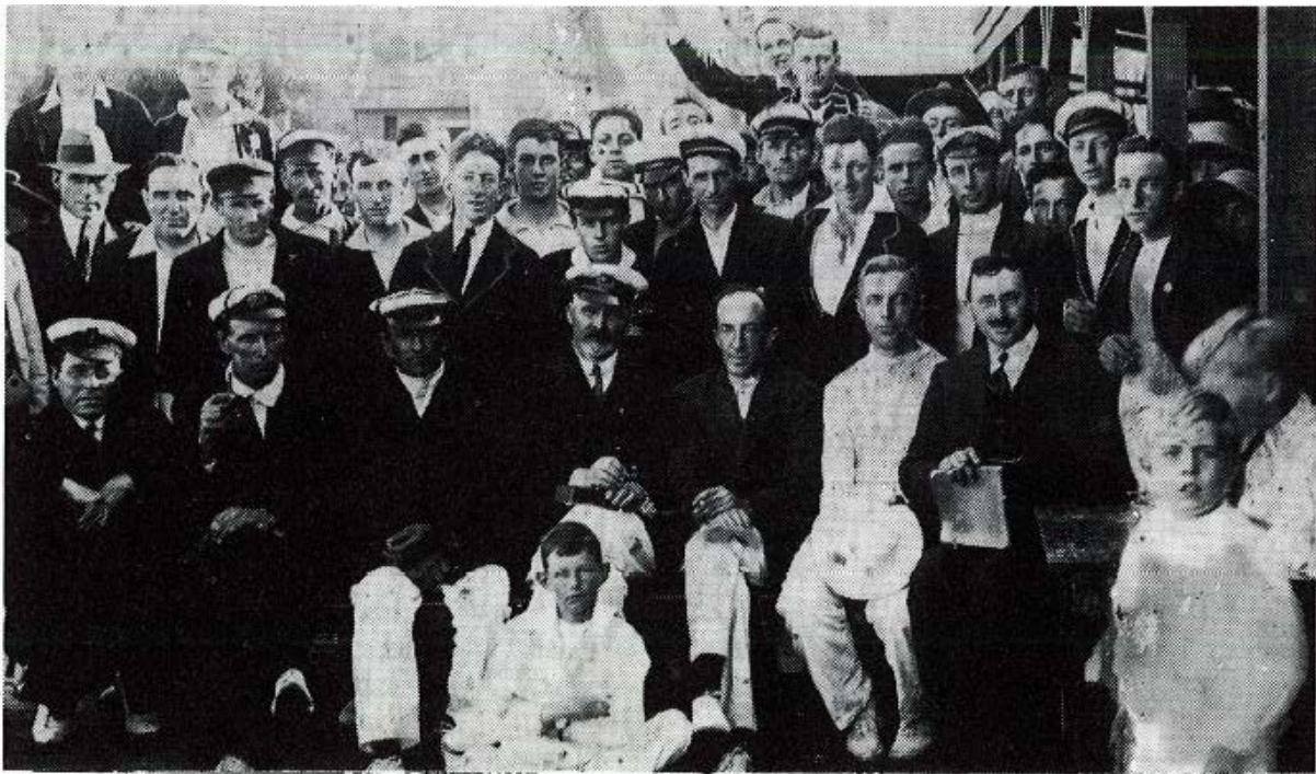
Gathering at the Yacht Club: Circa 1924.